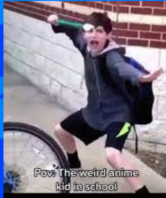
Pov: The weird anime kid in school